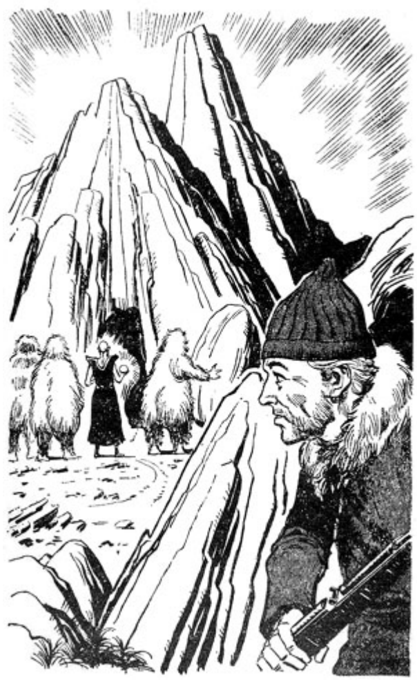
The other Yeti lifted the enormous boulder aside and Songtsen entered the cave.

Songtsen marched up to the boulder outside the cave. He took the sphere from the Yeti holding it. The other Yeti lifted the enormous boulder aside and Songtsen entered the cave. The Yeti grouped themselves around the entrance, motionless once more.