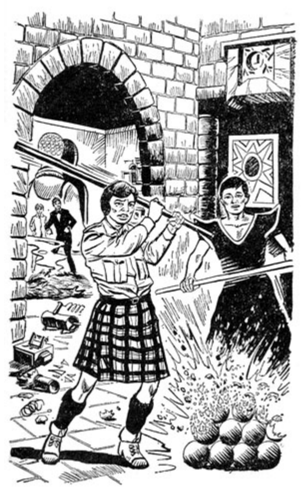
The pyramid... shattered into fragments as though made of glass.

'Goodbye, old friend,' said the Doctor, and lowered the frail body to the ground. Jamie and Thomni emerged from the control room.