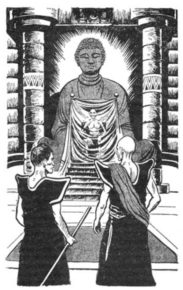
Padmasambuha spoke... His voice seemed to come from everywhere and nowhere.

The Doctor was starting to feel cold and cramped as he hung in his bonds from the ring on the Monastery door. Khrisong and his warriors were cold and cramped too, waiting high on the walls. But they stood guard bravely, spears and bows ready to hand, Suddenly one of them turned