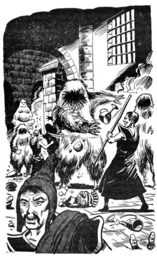
The Yeti raged unhindered throughout the Monastery.

destruction. It was in the storage cellars that most terrible havoc was wreaked. The Yeti smashed open food barrels, burst water tanks so that the food cellars were flooded, and mixed fuel, food, clothing and medicines into one unusable pile.