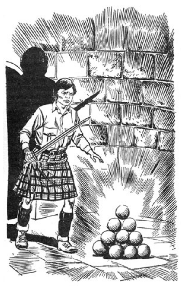
In the centre of the cave stood the source of the light—a little pile of silver spheres, arranged as a pyramid.

Jamie backed away as the boulder was swung completely clear. Light flooded into the tunnel, silhouetting the enormous shaggy figure in the cave mouth. With a blood-curdling roar, claws outstretched, it bore down on Jamie. Gripping his sword in both hands, the Highlander brought it round in a savage slashing cut that should have struck the